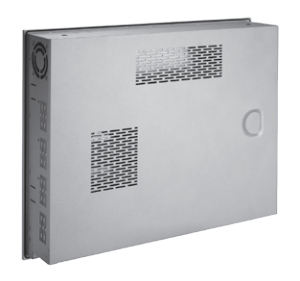
▲ Less screw design